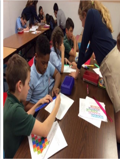
Middle school students in "Art in Math" elective, worked with 3 rd grade to show multiplication fact steps.